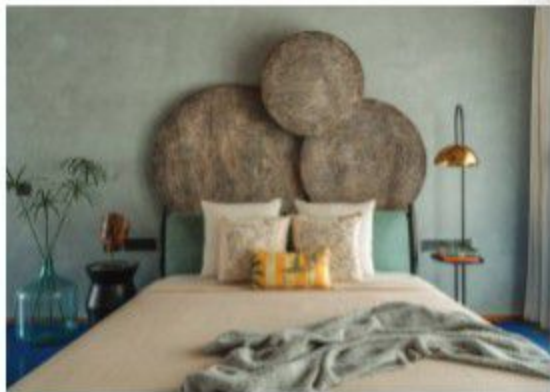
Kamala House, Tirupathi, Andhra Pradesh