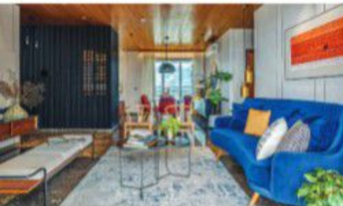
Apartment 5212, Bengaluru, Karnataka