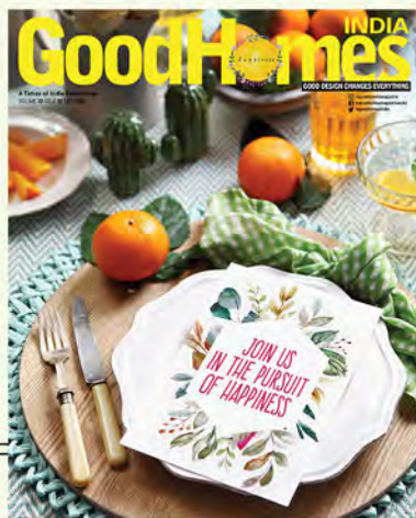
THE COVER STYLE SHREYA GUPTA