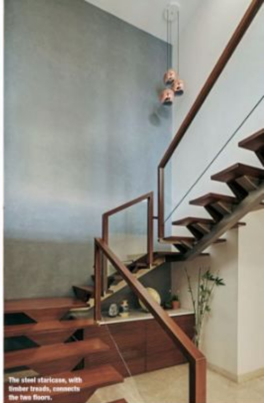
The steel staircase, with timber treads, connects the two floors.