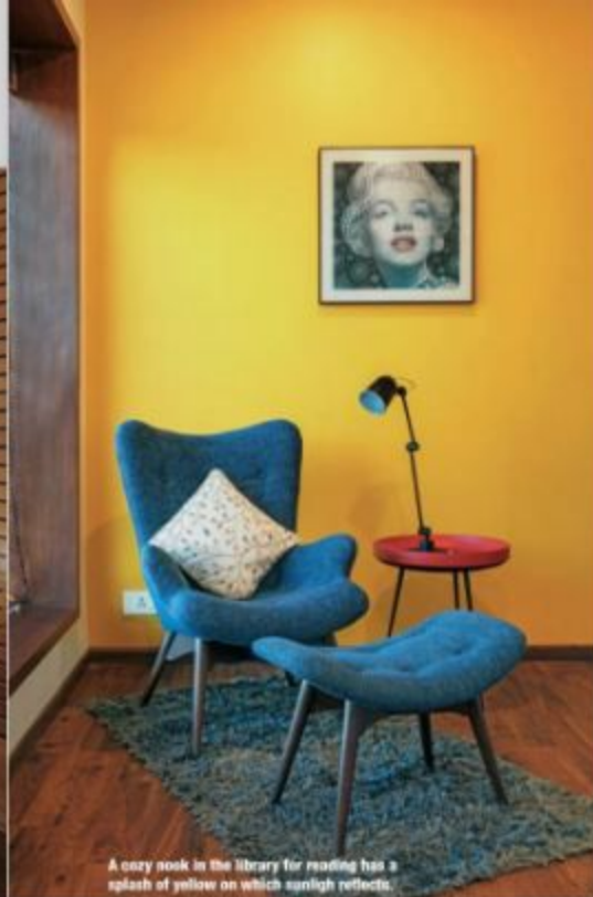
A cozy nook in the library for reading has a splash of yellow on which sunlight reflects.